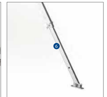
Altech Supasafe Handrail System uses outriggers instead of dead weights, offering full stability and safety