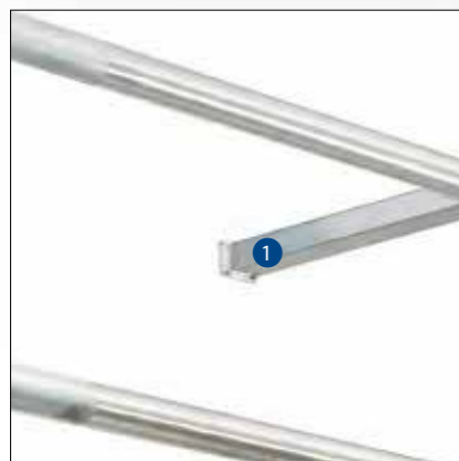
Handrail ends provide fall protection at platform end