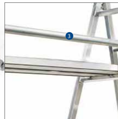
The Altech Supasafe Handrail System includes three telescopic, fully adjustable handrails