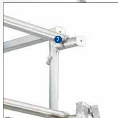
Quick fit and release graspers hold hand rail firmly onto vertical post arms