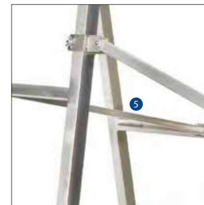
Spreader bar securely holds the trestle open