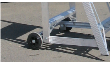
Step-Thru moves easily over sealed or unsealed surfaces making it ideal for indoor or outdoor use.