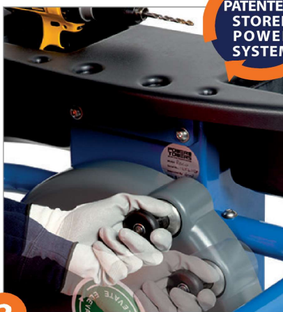
2 Simply turn the handle...