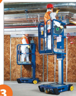
3 ...3.5m working height in 11 seconds.