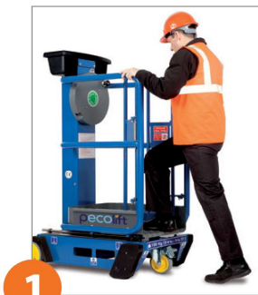
1 Step in.

BATTERY FREE POWER FREE OIL FREE EASY!FAST!SAFE! AWARD WINNING